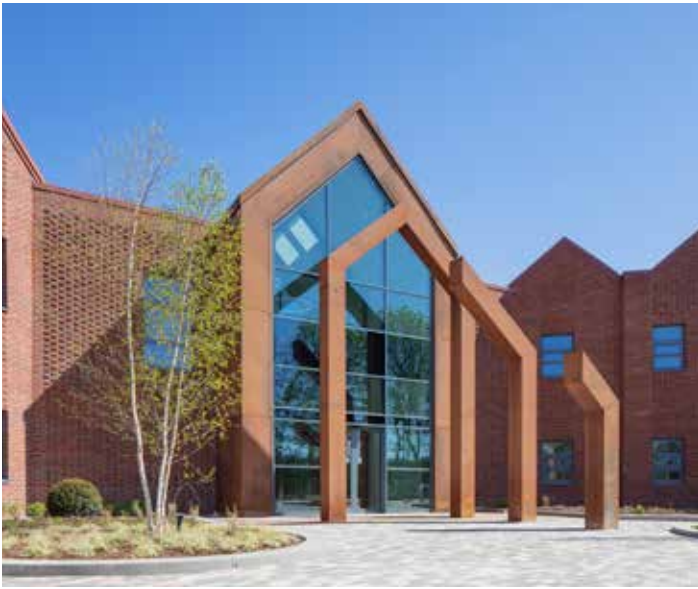
Foss Park Hospital, York