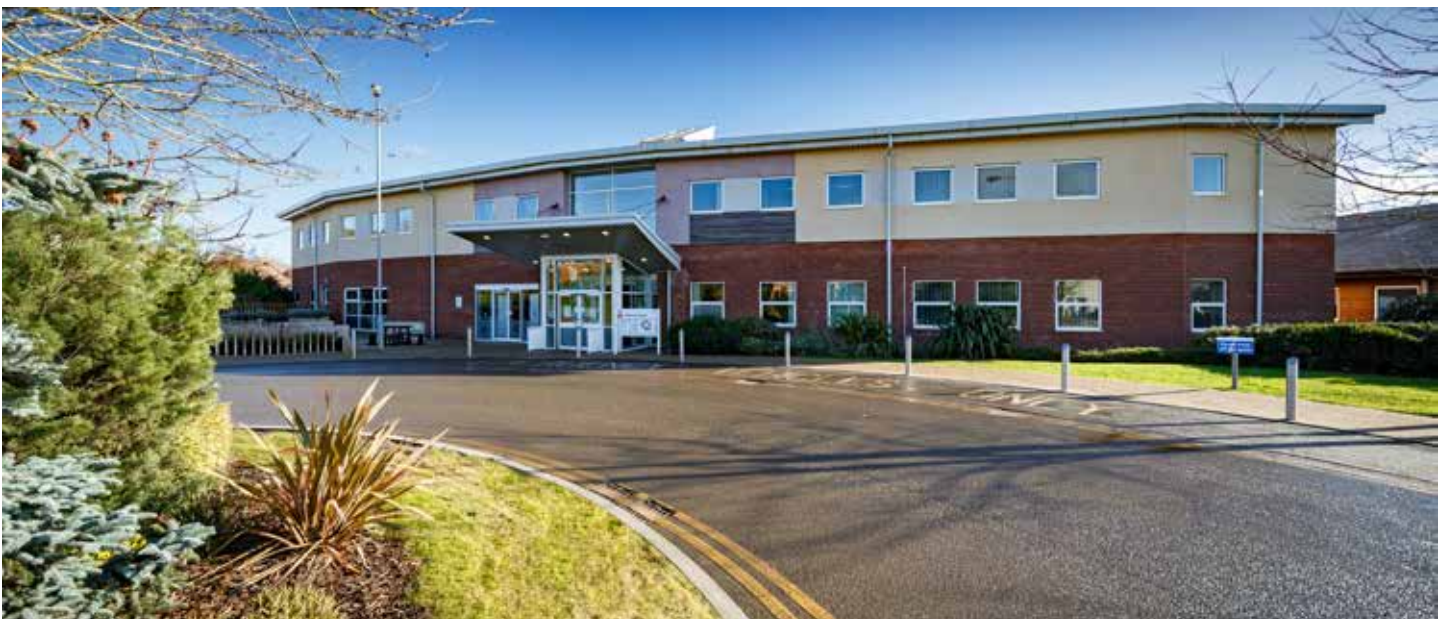
West Park Hospital, Darlington