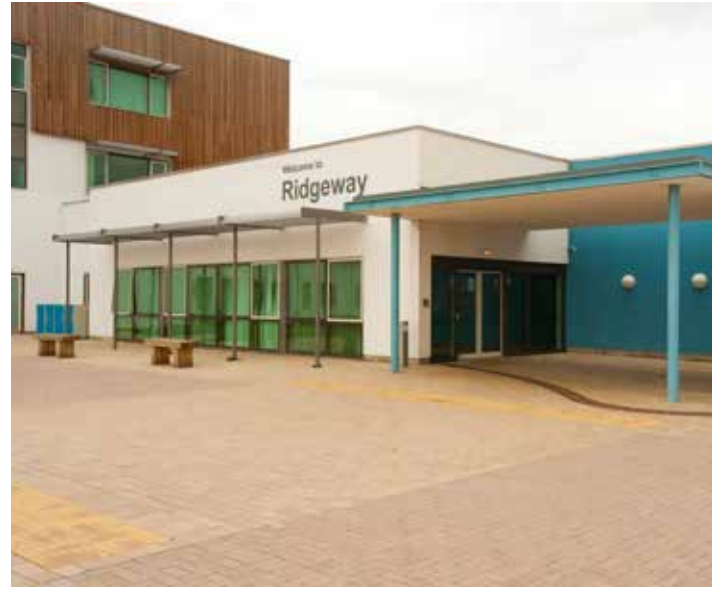
Ridgeway, Roseberry Park Hospital, Middlesbrough