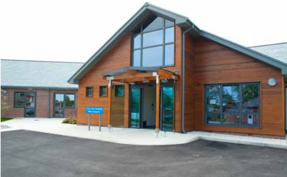
Cross Lane Hospital