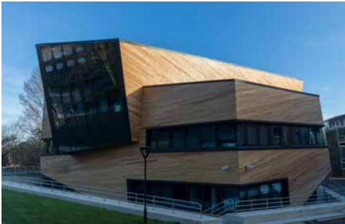
Leeds University. Durham University.