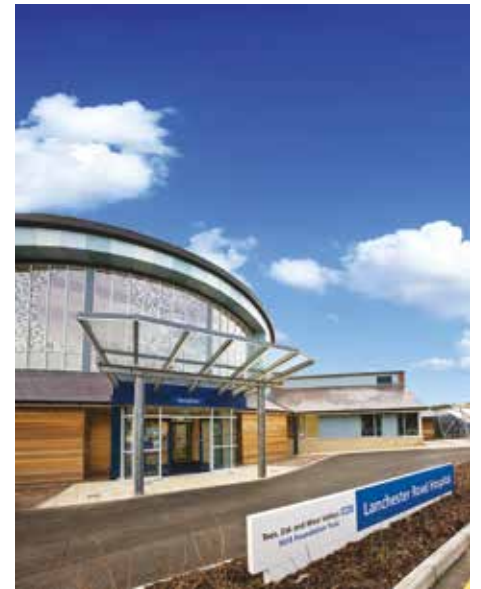
Lanchester Road Hospital, Durham