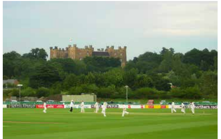
Tour de Yorkshire. Durham Country Cricket Club.