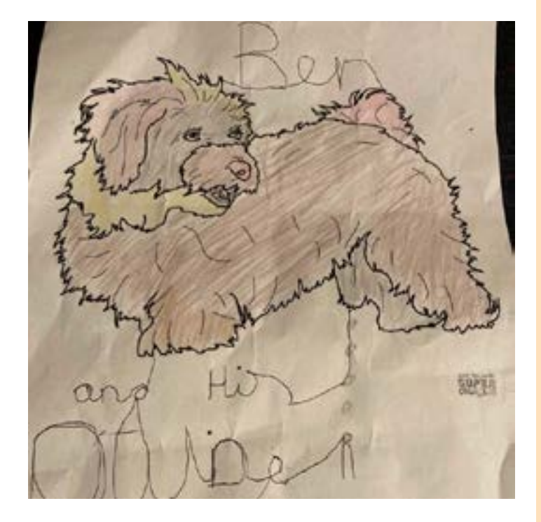
A picture of Ben the therapy dog - coloured in by a patient who chats to Ben during hospital visits.

If you'd like to get involved with volunteering with your dog across our Trust sites, please contact us: <u>tewv.volunteer@nhs.net</u>