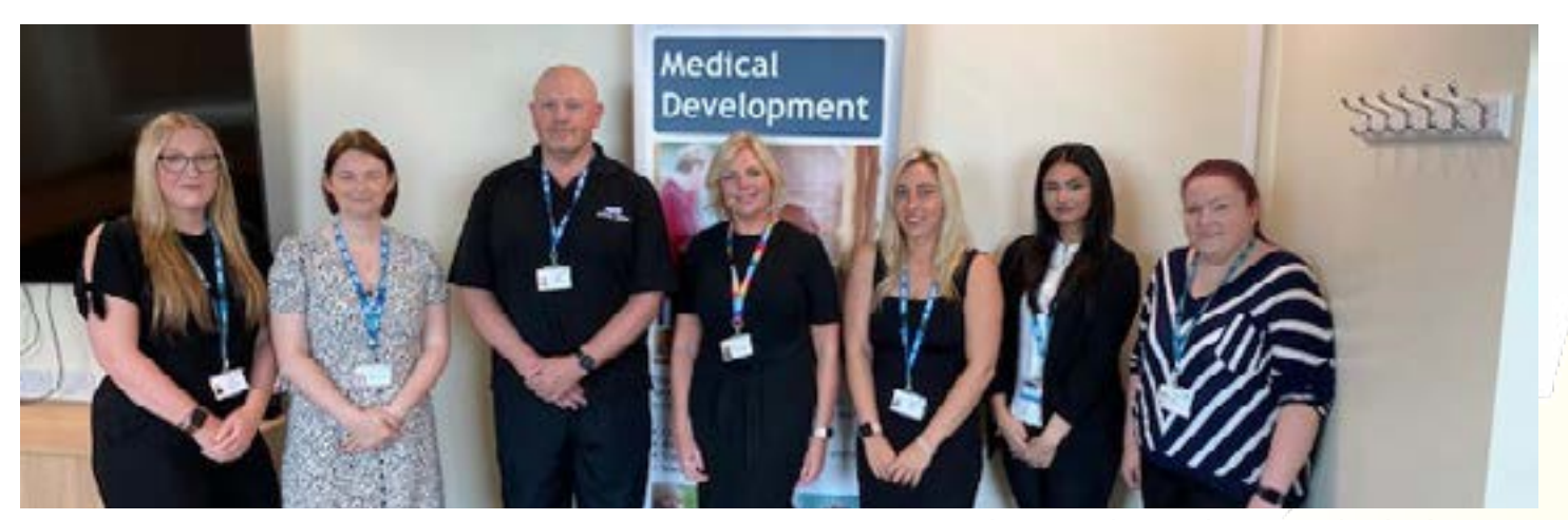
Our northern undergraduate medical education team working with student doctors.